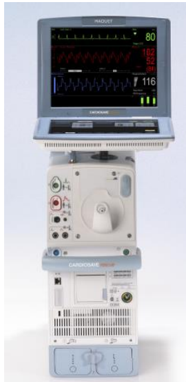
Figure 4: Cardiosave in Transport Configuration

An unexpected shutdown upon battery removal cannot occur for Cardiosave Rescue.