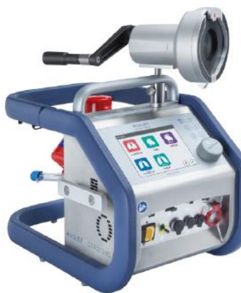
Figure 1: CARDIOHELP with Emergency Drive on top

The CARDIOHELP system is a miniaturized medical perfusion system. Its general function is to drive, to control, to monitor and to protocol the extracorporeal circulation. It acts as a drive unit for a disposable tubing set including at least pump and oxygenator. The CARDIOHELP Emergency Drive (Figure 1) is used in emergencies to manually drive the disposable if the CARDIOHELP-i fails.