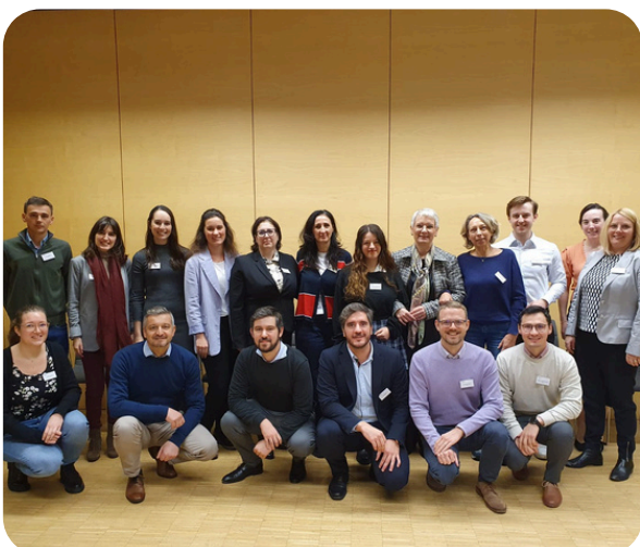
Date: 4/5 November 2024 Location: Bonn, Germany and online