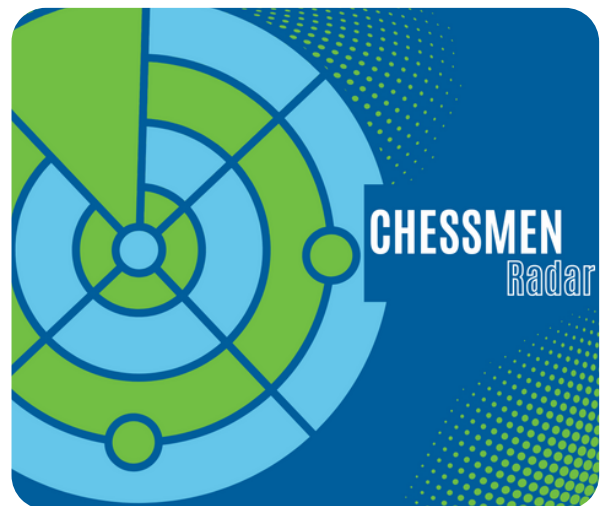
Date: January/May 2024 Location: Online

This initiative comprises one-minute videos regarding the accomplishments, ongoing work and foreseen deliverables of each WP.