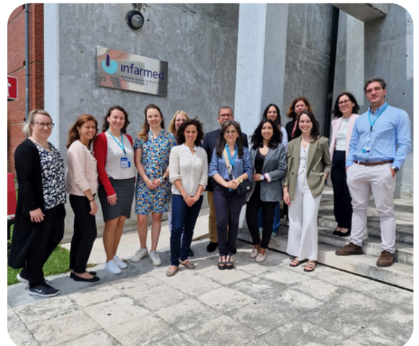
Dates: 19/21 June 2024 Location: Lisbon, Portugal

Discussions focused on the tools, databases, procedures and methodologies used in Portugal. Key areas for improvement were identified for future CHESSMEN meetings.