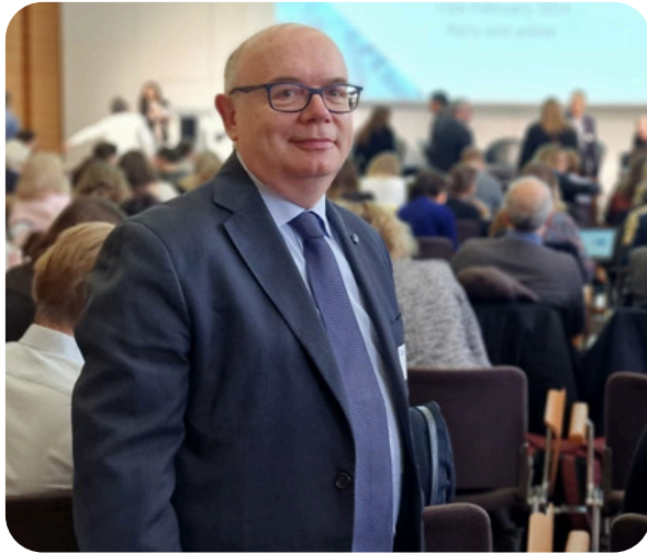
Date: 13 February 2024 Location: Paris, France