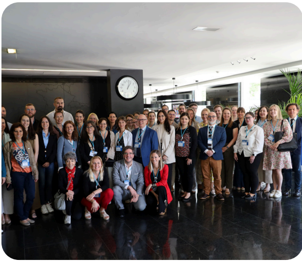
Dates: 19/21 June 2024 Location: Lisbon, Portugal